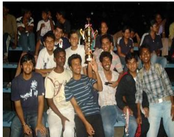
Jubilant winners of the Brij Bhushan trophy

The BITSAA International Graduate Application Scholarships were founded in 2007 to encourage BITSians to apply to the best schools around the world for pursuing MS and PhD programs. Three aspiring BITSians who plan to pursue their graduate studies in top tier universities will be awarded $ 500 each to help fund their application fees to these programs.