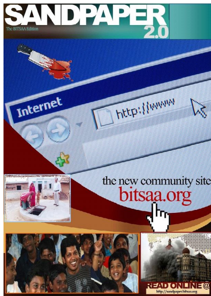
Sandpaper – Spring 2009 edition