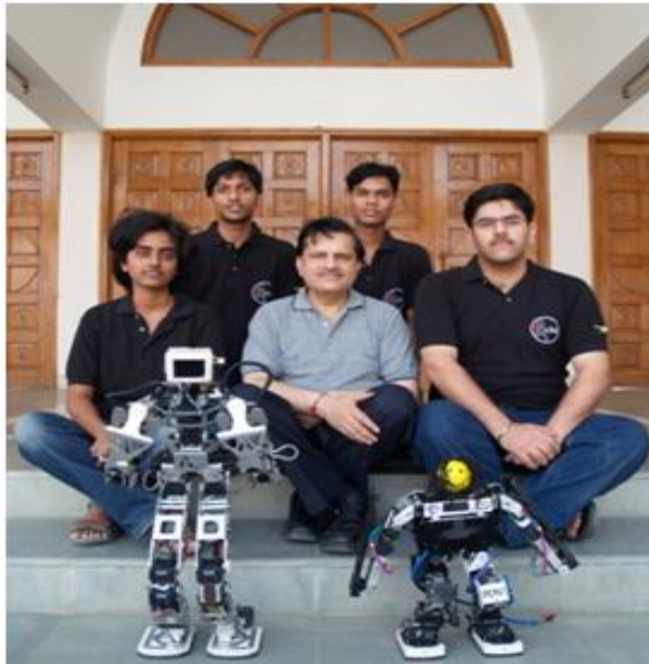
The Acyut Team . BITSAA International raised $6892 for Team Acyut in 2009 thanks to donors like you