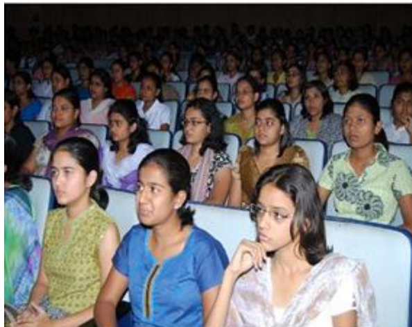
A Let's promote BITS Pilani session in progress